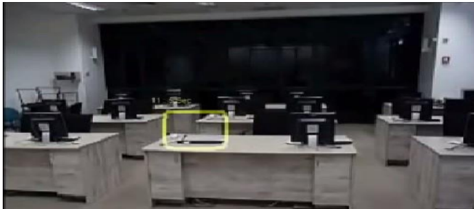
Fig. 5: Object Detection