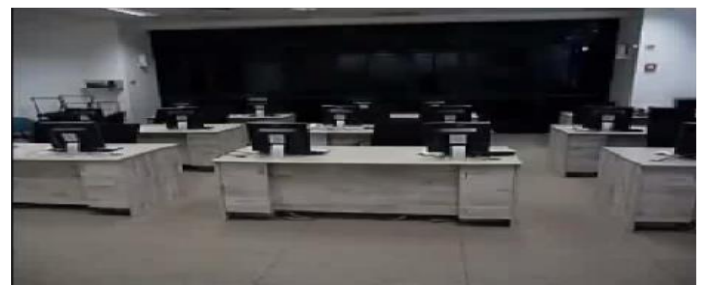
Fig. 2: Background picture

1) Background Model : in this model the background image is dynamically updated. Here allow small changes in illumination and new static object introducing. This background model is so sensitive when illumination suddenly changes.