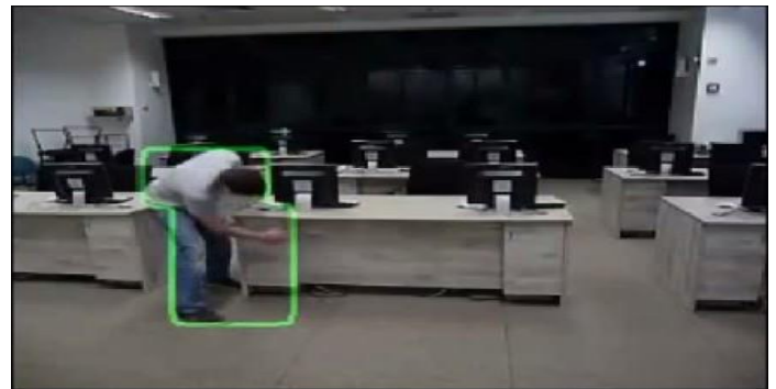
Fig. 3: Tracking Object

Repeat step a through f for all frames in video which is suspicious video.