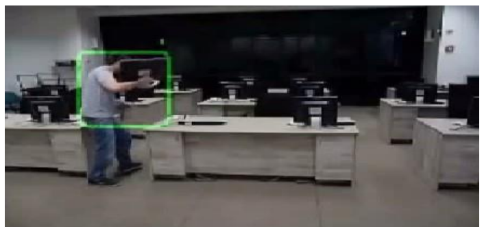
Fig.4: Suspicious moment