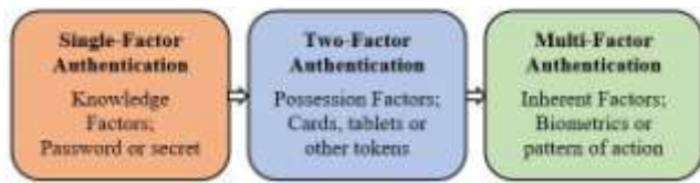
FigureA. The Evolution of Authentication Methods

proof of their identification, which is dependent on two or three different factors, this move provided an enhanced degree of security.