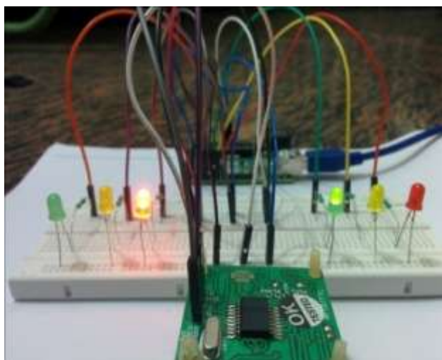
Fig.2. Snapshot of the circuitry

The figure2 shows the implementation circuitry connections of hardware and its connectivity. It is tested with the hardware devices with demonstration results. Figure 3 shows the software Aurdino Uno interface with algorithm and its implementation. The proposed system endeavours to reduce the occurrences of traffic jams, due to the traffic lights by allowing the road with higher density of conveyances and withal provides the clearance for the emergency conveyance