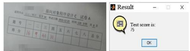
Figure.4. Another successful case

Score summation is the final step of the experiment. The main task in this process is to calculate the true score of each question, and finally sum the scores and output the results. The input and output of another successful case are shown in Figure 4.