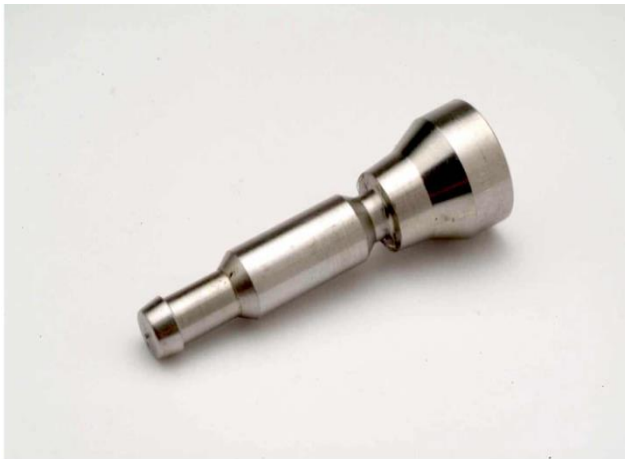
Figure4. Modal created on the CNC Turning Machine