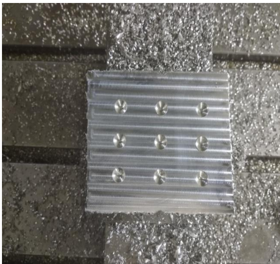
Figure5. Drilling operation on CNC machine