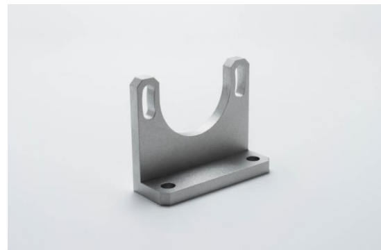
Figure2. Modal Created on the CNC Milling Machine