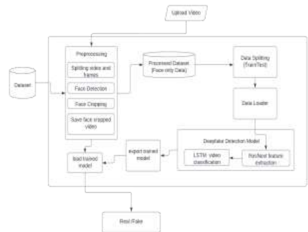
figure1: System Architecture

The suggested system & #39; s basic system architecture is shown in figure: