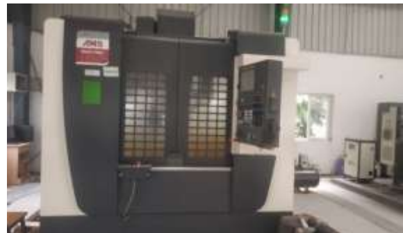
Fig. Error! No text of specified style in document. CNC vertical milling machine

Nowadays CNC machines are widely used for manufacturing complicated parts and used for high production rate with accurate in less time. In this we are using 3 axes CNC vertical milling machine where the spindle is moved in horizontal direction. In this the spindle moves and work piece remains constant in its position. The movements of spindle in XYZ are as follows in figure 3: The movement of the spindle in X direction is forward and backward movement The movement of the spindle in Y direction is front and back direction. The movement of the spindle in Z direction is up and down direction.