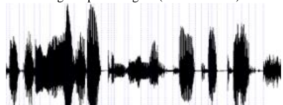
Fig.4. Speech Signal Spectrum(Frequency Domain)

The above figure defines the speech signal spectrum according to time and frequency domain in Mel-frequency co-efficient cepstral.