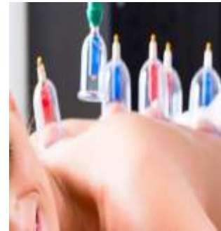
Fig. 5. (a) Conventional cups for vacuum therapy

We began our research by looking for innovative instruments available in the market related to alternative medicine therapy and survey of the accelerating business opportunities in India. This could be feasible only through qualitative research design, using questionnaire, and taking interviews of patients undergoing acupressure and acupuncture treatments for their diseases in, Navi Mumbai and Mumbai., India. In spite of accelerating innovations globally, the public are lacking in the awareness of technology and Chinese technology based innovative tools for cure of various diseases.