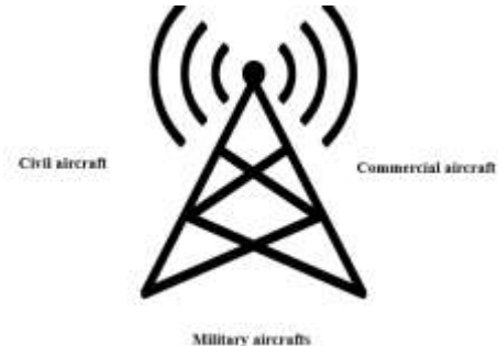
Figure 2. GPS interference

warfare systems. It must also be capable of not jamming the civil aircraft and ensure the pilot does not lose control over it. There is a need to establish resilient navigation and surveillance infrastructure enabling the fighter aircrafts to overcome the GPS outage.