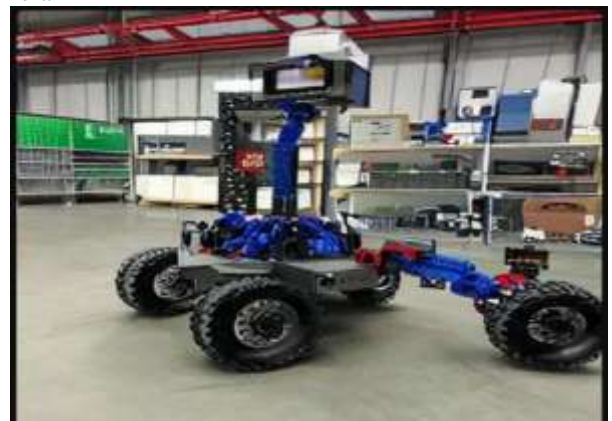
Fig 2. Picture of a Four-wheel Robot with sensors and a camera (example of an intelligent robot with computer visioning)

Viewing in Fig 2. A four-wheel robot with sensors and a camera