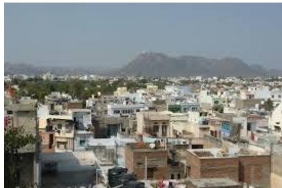
Figure 1- view of Kali-Magri houses

Kalimagri is a medium size village located in Salumbar tehsil of Udaipur district, Rajasthan with total population of 8162 of which 4298 are males and 3873 are females as per 2018 survey report. Majority of the people are followers of Hinduism constituting a percentage of 92. Whereas there are 8per cent of population comprises of Muslims. There were three types of houses, Kuccha, Pucca and Semi Pucca covering percentages of 5per cent, 57per cent and 38per cent respectively. Gram Panchayats are the local political units of rural areas. They monitor the infrastructure and the decision making of the village lie in their hands. The village has its own Anganwadi Centre. It provides facilities like supplementary nutrition, non-formal preschool education and nutrition and health education.