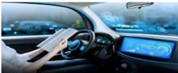
Fig. 10: Vehicle connected to the cloud settings iv) Internet of Things

Cloud computing has certain advantages that make it the perfect platform for staging and deploying AI technology in the automotive field. Among these are fast processing speed, big data access and analytics, and centralized connectivity. As companies endeavor to develop cutting-edge automotive technology, cloud-based platforms will be developed to support them. One instance of anywhere the control of the cloud is being cast-off is the company among General Motors and IBM's Watson supercomputer. An extension of GM's popular OnStar system, the platform being developed will include AI-enhanced features