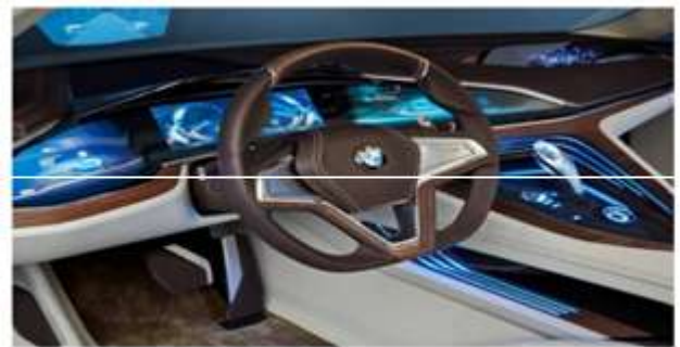
Fig. 12: BMW harnessing the cognitive abilities of IBM Watsonvi) Infotainment System

Insights wanted be drawn from plenty of formless data to decide on how to answer naturally in actual time. Cognitive capabilities wanted be able to switch dynamic operating circumstances as well. Car manufacturers have previously started integrating this into their automobiles.