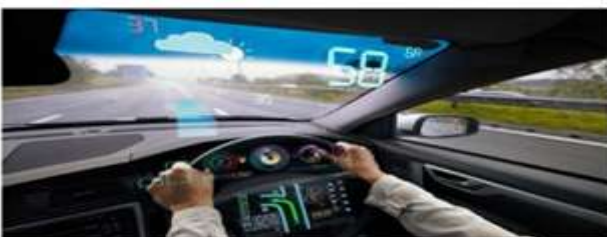
Fig. 11: Internet of Things utilized in an automobile

As a result of 2020, manufacturing specialists approximation that almost 250 million cars determination be associated to the Internet. With new cars coming prepared with a crowd of keen sensors, entrenched connectivity requests, and big data improved geo analytical competences, it only brands intelligence to have an IoT relationship as healthy. At this time are fair a few of the habits IoT technology is impacting, or will quickly impact the motorized manufacturing.