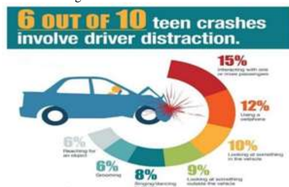
Fig. 6: Reasons for Crashes due to distraction

The safety factor while driving an automobile is something that cannot go neglected. It is one of the key feature that can cause or prevent a catastrophe. Even though all the standard or elite class auto mobiles has been equipped all the latest available technologies that increases the chances of driving safety, statistics tells a different story. As per “accident attorney” website, the major form of distraction is texting, talking to co passenger, high volume music, alcohol etc. And what is more concerning is that majority of them are caused in teenagers.