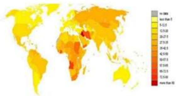
Fig. 4: Road Fatalities per Capital (WHO) ii)Grand Theft Auto

(World report on road traffic injury prevention, WHO, 2004).