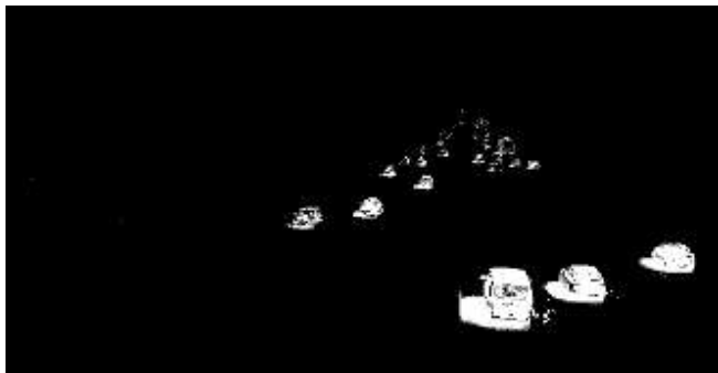
Fig.5. Edge Detection Result