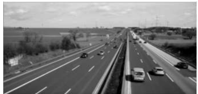
Fig.3. The RGB video converted into grayscale format