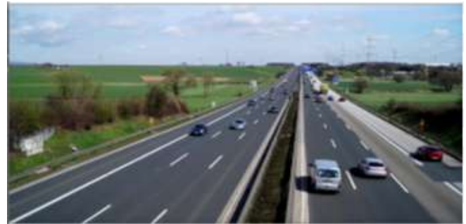
Fig.2. Input to the system as RGB format