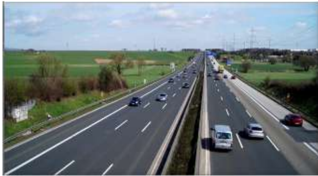
Fig.4. Original Image