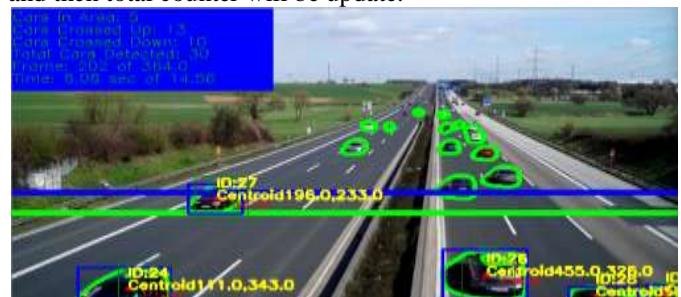
Fig.7. When the vehicle centroid crosses the imaginary line in ROI, the respective counter variables increase.

For the moving vehicle part to count the vehicle the system have implemented the centroid which will have condition as set for a vehicle has tried to touch or managed to cross an imaginary line in ROI. When 2 ROI coordinates are connected diagonal direction, a line called the imaginary line appears. The vehicle is counted once the vehicle manages to cross centroid in ROI which is imaginary line. From fig. 6, which have different parameter in the box as cars in area the area is names as ROI, the cars crossed up/down means direction of moving cars fetched through the centroid. The car will pass from the centroids and will tell the direction and after that the system will also count the number of moving vehicles. The vehicles which are passing through the ROI will be counted and then total counter will be update.