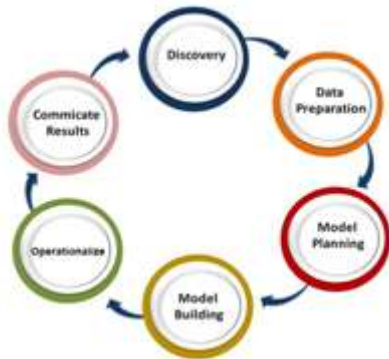
Figure 2: Phases of data science life cycle

The preliminary step is asking the correct questions, and is a necessary part of the discovery process. Project's budget, priorities, and fundamental requirements are decided before beginning any data science project. The project's prerequisites, including the quantity of workers, available technology, available time, available data, and the project's end aim, must all be established during this phase before the business challenge can be framed at the first hypothesis level.