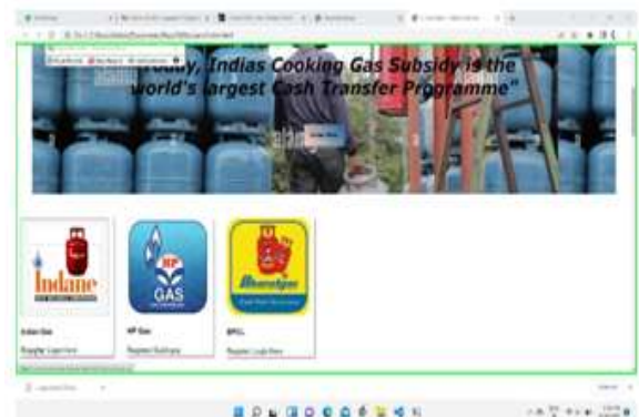
Fig 10. Using different gas agencies

F. Consumer can register for different gas providing company