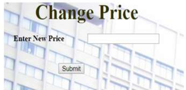
Fig.9. Price changes

E. Dealer has the accesses to change the price as per their stocks and governance.