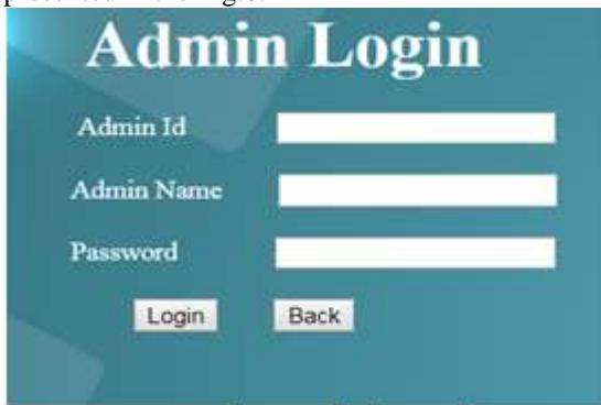
Fig.6. Admin Login

B. Admin can Register at first then he/she can login through the Id's with the rename and password. The process is represented in the Fig.6.