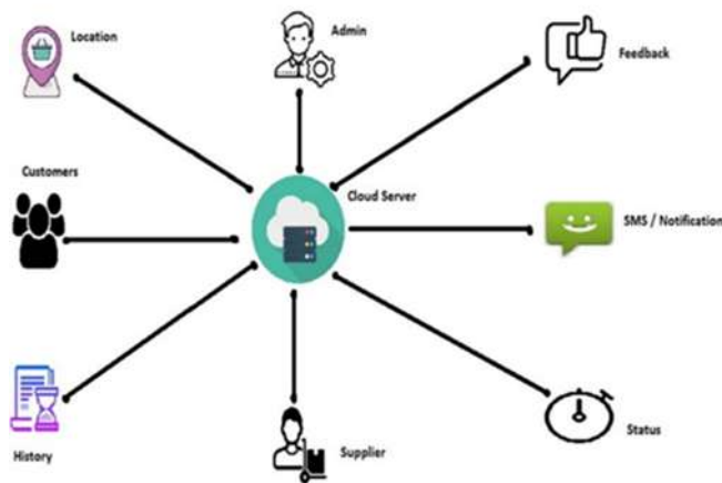
Fig. 2. Consumer Feedback

5.Consumer Feedback: After the successful delivery of the product the consumer can give their experience about the service and as well as the delivery person for their job. In Fig 2 the proposed framework is viewed.