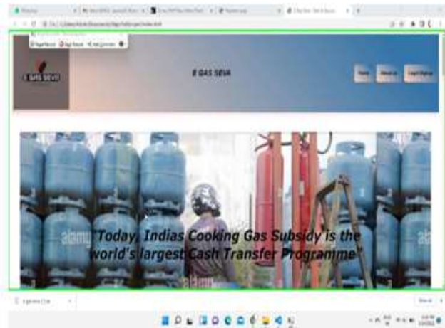
Fig5. User Interface

B. Admin can Register at first then he/she can login through the Id's with the rename and password. The process is represented in the Fig.6.