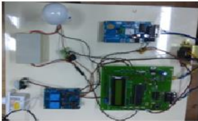
Figure 3 Energy efficient street lamps with fault detection using GSM module

Fig 3 shows the working model of the energy efficient street lamps