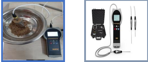
Figure1. TLS 100 System