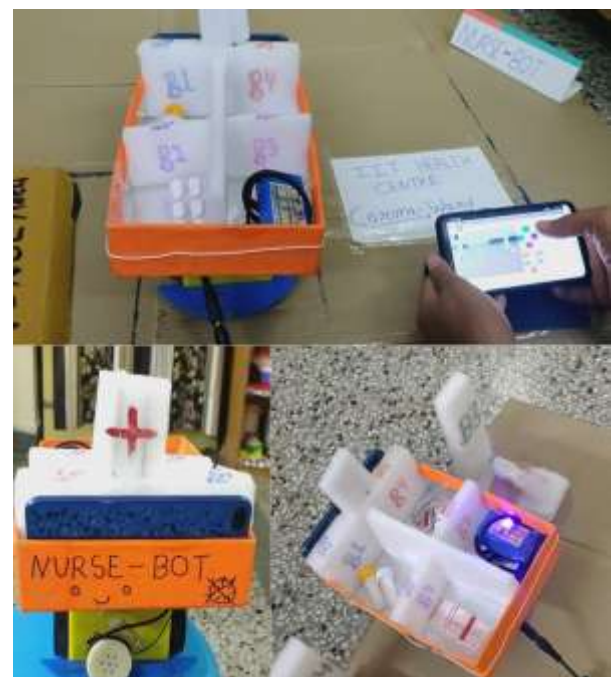
Fig 4: Actual images of robotic vehicle prototype

Alarm and LED: The alarm and LED lights are used to provide indication and alerts to patients when it is time to take medicine or when their body temperature is outside of the normal range.