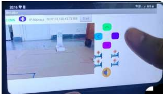
Fig 2: Actual image of Application created.

MIT APP INVENTOR BASED ANDROID APP: The Android app is designed using the MIT App Inventor platform, allowing for easy and intuitive control of the robotic vehicle.