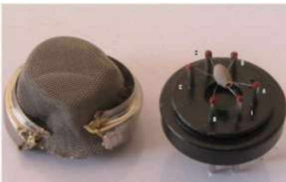
Image Showing Hexapod Structure inside a Gas Sensor

The gas sensor module consists of a steel exoskeleton under which a sensing element is housed. This sensing element is subjected to current through connecting leads. This current is known as heating current through it, the gases coming close to the sensing element get ionized and are absorbed by the sensing element. This changes the resistance of the sensing element which alters the value of the current going out of it.