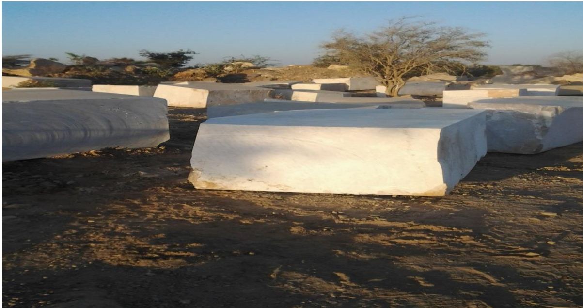
Fig. 3. Stock Yard of Dichinama Marble (Lidge Mariam) Quarry Site