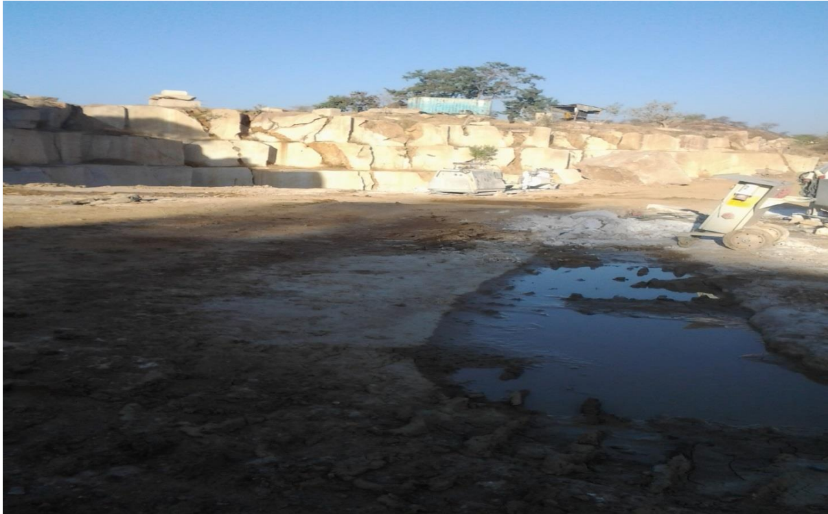
Fig. 2. Dichinama Marble (Lidge Mariam) Quarry Site

In the study area of Dichinama Quarry Marble (Lidge Mariam) site the first step in quarry mining which includes the removal of unwanted materials like plants, soil, weathered rocks, and other materials cleared from the deposit (mineralized area) using the loader or using diamond wire cutting machines it depends on if the material is soft such as soil and plants loader is preferable unless diamond wire cutting machines to uncover the Marble which is economically important.