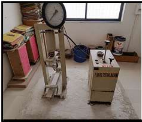
Fig. 1. Flextural Testing Machine