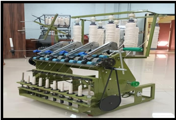
Figure 1: New Modified charkha

The New Modified charkha is shown in above figure1. This 8-spindle charkha consists of chain sprocket arrangement to perform the operation of yarn production. There is a lot of traction in India for the production of coarse to fine count cotton, blended yarns and worsted yarns with New Model Charkha (NMC).