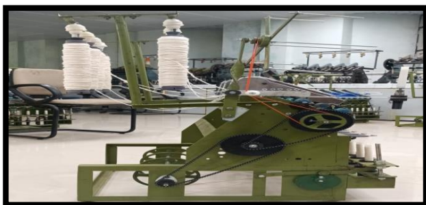
Figure 1.1: Side view of New Modified charkha

This micro size machine consisting of six to eight spindles is turned by hand in a sitting posture by the village women. The earnings made by producing yarns help in supplementing the income of the family and empower the village women. To enhance income and reduce drudgery, an effort has been made to improve productivity and ease of operation by suitably modifying the existing design. In the design, mode and means of motion transmission have been redesigned. Reduction in rotating elements such as gears and pulleys, addition of