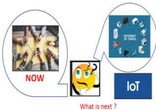
Fig. 1. Representation of think for next generation

"Internet of Things" was stated by Kevin Ashton in 1999. Ashton who was working in supply chain optimization, wanted to attract senior management's attention to a new exciting technology called RFID. Because the internet was the hottest new trend in 1999 and because it somehow made sense, he called his presentation "Internet of Things". IoT-enabled applications have become part of larger business objectives, enabling digital transformation with a focus on new services and applications. He quoted IoT as next generation of internet.