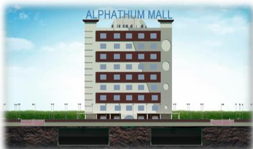
Figure 1: Rainwater harvesting proposed in the system