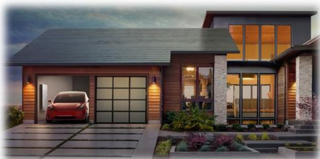
Figure 3: Solar tiles used on a residential building