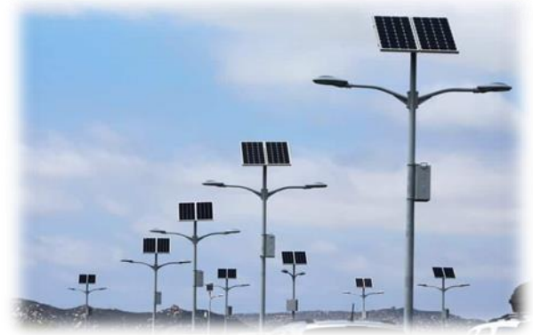
Figure 2: Solar panels on parking lights

Current plans utilize remote innovation and fluffy control hypothesis for battery the executives. The street lights utilizing this innovation can work as an organization with each light having the capacity of playing out the turning on and off of the organization.