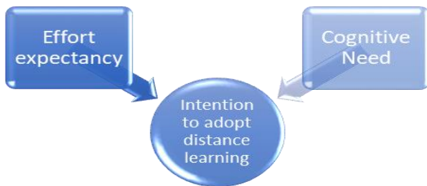
Figure 1: Study Model

Base on the above-mentioned literature and suggested hypotheses the following (figure 1) model is proposed: