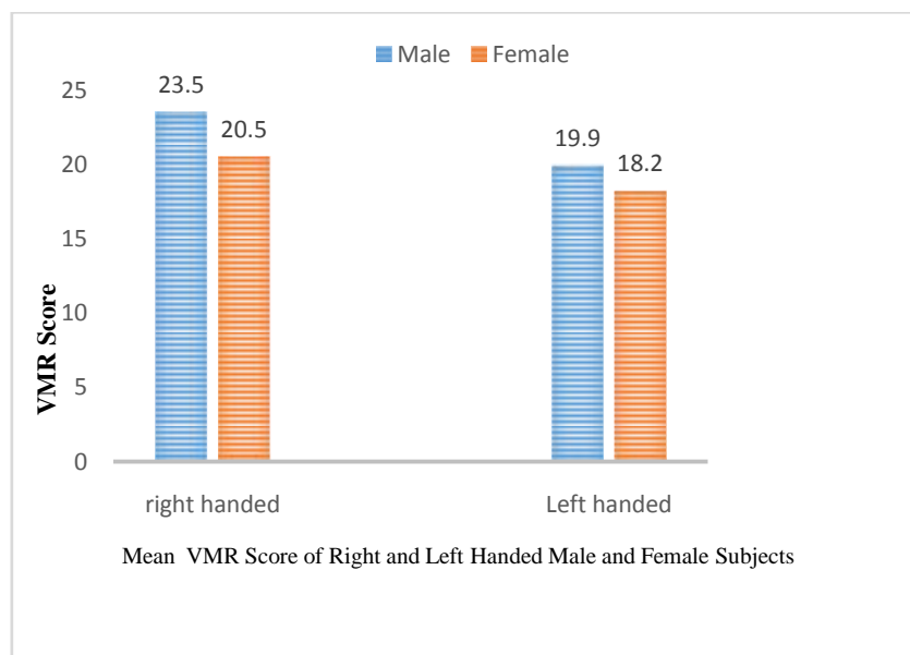
Fig-1: Mean Vandenberg Mental Rotation (VMR) scores a function of Sex and Handedness (left handed and right handed)

Figure-1 exhibits mean Vandenberg Mental Rotation(VMR) scores as a function of sex, handedness from 0 to 40. Mean score for right handed males was 23.50, whereas mean score for left handed male observed as 19.90. Mean score for right handed female was 20.80 and mean score for left handed female was 18.20.