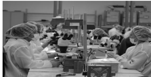
Fig. 1. Medical catheter production line. Own elaboration.

image, after a DWT transform, the image is divided into four corners, upper left corner of the original image, lower left corner of the vertical details, upper right corner of the horizontal details, lower right corner of the component of the original image detail (high frequency). You can then continue to the low frequency components of the same upper left corner of the 2nd, 3rd inferior wavelet transform[7,9].