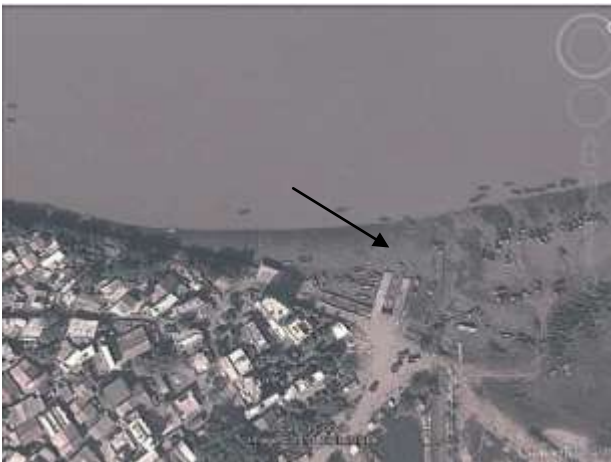
Figure 1: Sampling site

For the analysis of water parameters, the water samples were collected and preserved in pre-rinsed plastic bottles at monthly intervals during June 2011–May 2013 for the period of two years from the Dumas vicinity of Tapi estuary. Temperature and pH were analysed in situ and other parameters like dissolved oxygen (DO) conductivity, turbidity, nitrate, nitrite, phosphate, biochemical oxygen demand (BOD), chemical oxygen demand (COD), chloride and TPHC were analysed in the Research Laboratory, Department of Aquatic Biology, VNSGU, Surat. For the preservation and analysis of the water samples, the standard methods were followed [21,22].