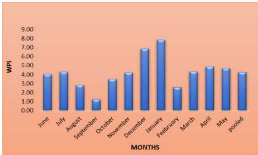
Fig. 5: WPI for the year 2012-13