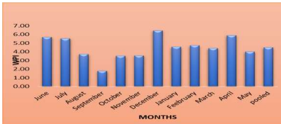
Fig. 4: WPI for the year 2011-12

The outcomes of this investigation revealed the quality assessment of the estuarine water body of Tapi River from Dumas areas for two consecutive years. This study highlighted poor water quality conditions of estuary in association with various physico-chemical parameters. The water quality variables showed fluctuations. Higher contaminations of components were found during pre and post monsoon then monsoon season. This might be due to the dilution of pollutants during monsoon season. This monitoring field study provides an informative preliminary data about water quality variables and helps to understand the quality status of water bodies. The Water quality index revealed that the estuarine water of the Tapi River was affected by increasing anthropogenic activities as well as agricultural and industrial runoff occurred in surrounding area. Hence, this area can degrade the water quality and making it unfit for public use. Similar findings on water quality of Tapi estuary were described earlier and it was considered as polluted with input sources from industries, domestic and anthropogenic activities [31-35]. Many reports are also available on the polluted aspect of physico-chemical features of various estuaries from India [36,37,38]. Water quality of Damanganga and Par Estuary was also found to be of poor quality and exhibited polluted nature of the estuary [39,40].