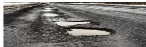
Fig. 1. Sample Pothole image

Each frame is analysed using the YOLOv4-tiny deep learning model. The model outputs bounding boxes around detected potholes along with their confidence scores. Post-processing is applied to filter detections based on confidence thresholds. Detection results are stored in a SQLite database. A web-based HTML interface allows users to interact with the database.