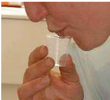
Fig.3. 1: Draining Method

The problem is made to sit down quietly with the head bent down and the mouth open to permit the saliva to drip passively from the decrease lip into the graduated sterile tubes. Saliva amassed by way of draining is without any stimulation and is more reliable.