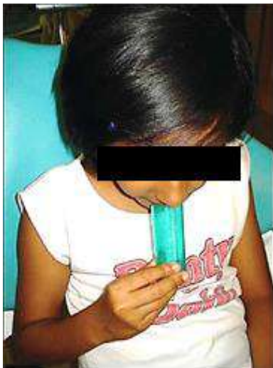
Fig.3. 2: Spitting Method

Spitting Method: Saliva is allowed to accumulate in the floor of the mouth and the difficulty spits out it into the preweighed or graduated test tubes. The advantage of this approach is that it can be used when the glide price is very low and the place evaporation of saliva has to be minimised. The drawback is that it may have some stimulatory effect, and consequently can't be used for unstimulated saliva collection.