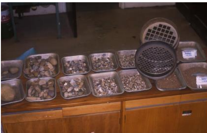
Fig. 1: Sieve Analysis Showing Aggregate Size Distribution [78]