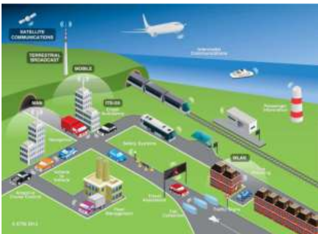
Figure 2. The Intelligent Transportation System

The foundation of an ITS system is its input data, that is the data from the sensors. Generally sensors are discerned in mobile and static ones. For example: