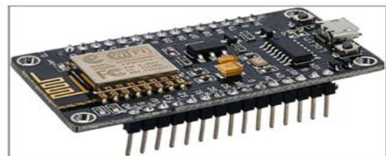
Fig 2. Esp8266 Nodemcu (snapshot)

threshold detected. The microcontroller board was selected by understanding some of the features it provided. These features will assist us in fulfilling the objectives specified earlier.