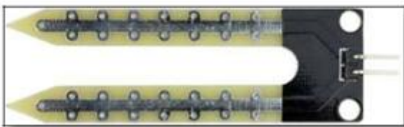
Fig. 3 Soil Moisture Sensor probe(snapshot)

This sensor has a fork-shaped probe with two exposed conductors, which acts as a variable resistor (just like a potentiometer) whose resistance varies according to the water content in the soil.