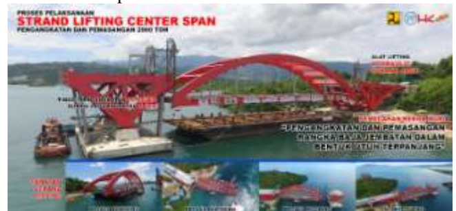
Fig. 2. Center Span Appointment in Jayapura

All innovations that have been planned continue to be finalized and realized with careful planning and calculations, until this innovation is approved by all parties, especially by The Bridge and Tunnel Road Safety Commission (KKJTJ) which oversees the design to the implementation of the Holtekamp bridge. Based on the innovation of delivering a complete frame of 3200 km and lifting a complete frame, this project received 2 Indonesian MURI records (Delivery and Lifting). With the implementation of these innovations, the installation of structural steel is carried out 6 months faster than using the on-site method. So that the Youtefa bridge can be completed earlier than the target set by the government from 2019 to September 2018.