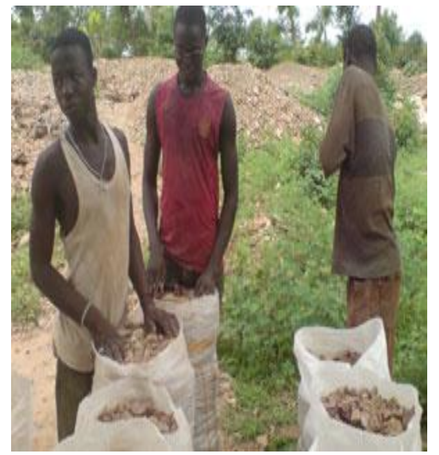
Plate 4: Artisanal Mining Iron Ore in Kontagora

The result shows that artisanal mining involves the miners create harmful effects as a result of digging the minerals come in contact with water bodies thereby releasing heavy and poisonous metals contain in the rocks as gangus are deposited (Plates 5 and 6). This might result in polluting the water bodies and the underground water.