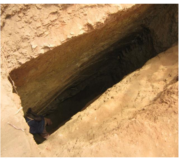
Plate 6: Heavy Earth Removal by Miner

Effects on Biological Environment: The result also shows that artisanal miners create lots of noise in the process of mining particularly in the process of drilling of minerals under the rocks. The vibration natures in the process of mining affect the settlement around the areas where mining takes place for example in Bida area most settlement around the mining site tends to relocate to other areas. Also included on the effects are those created to the fauna. The noise and vibration created affect the animals to be forced out of their natural habitat to other location and the vegetation cover are been cleared for mining activities.