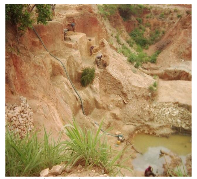
Plate 1: Artisanal Mining Iron Ore in Kontagora

The activities of these artisanal miners as alter the physical nature of the environment. This can be seen in most of the Plates 1 and 2 where the top and nutritious part of the soil are been altered where the nutrient are been carried away as a result of digging of pits and tunnels (lotos), dumping of debris heaps and quarrying.