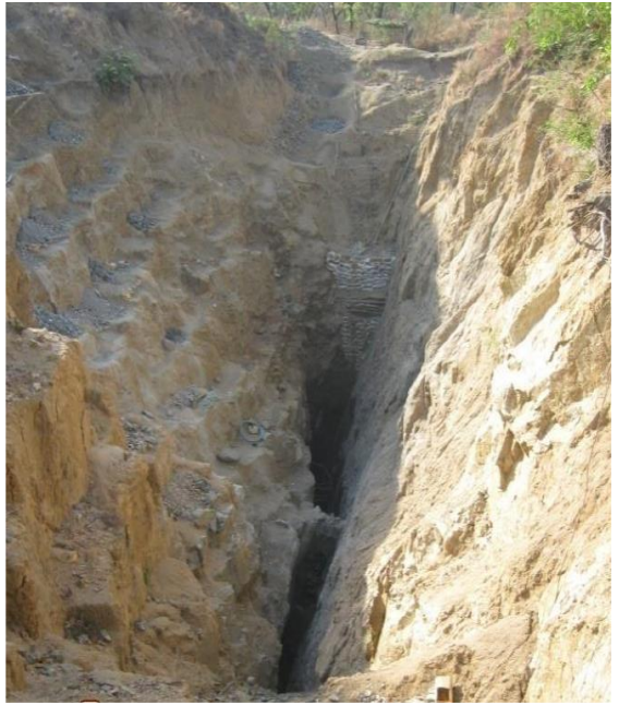
Plate 3: Artisanal Mining Iron Ore in Kontagora

The miners after digging and extraction of minerals leave the area unreclaimed their by causing serious erosion (Plates 3 and 4).