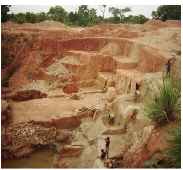
Plate 2: Artisanal Mining Iron Ore in Bida

The miners after digging and extraction of minerals leave the area unreclaimed their by causing serious erosion (Plates 3 and 4).