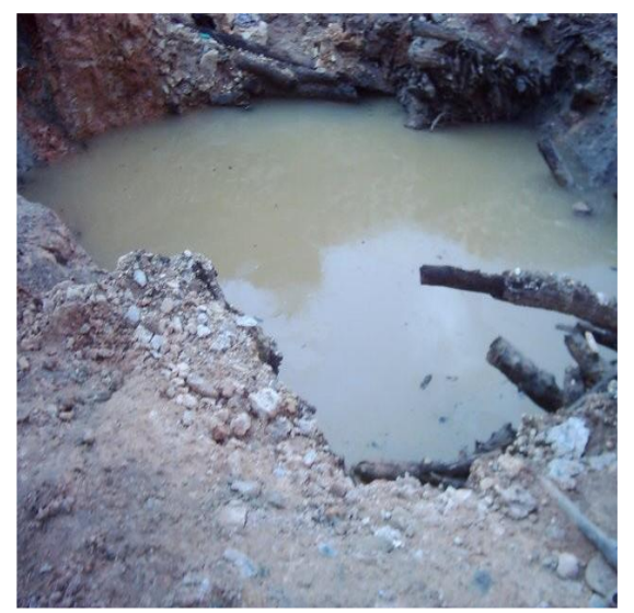
Plate 5: Water in Abandoned Mining Site

The result shows that artisanal mining involves the miners create harmful effects as a result of digging the minerals come in contact with water bodies thereby releasing heavy and poisonous metals contain in the rocks as gangus are deposited (Plates 5 and 6). This might result in polluting the water bodies and the underground water.