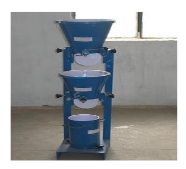
Fig. 6 Compaction factor apparatus

The compaction factor test is most widely used for the workability of the concrete mix. It is the ratio of partially compacted concrete to the fully compacted concrete. The apparatus used for the test are compaction factor apparatus, trowel, hand scoop, steel road, and a balance. The compaction factor apparatus is shown in Fig. 6.