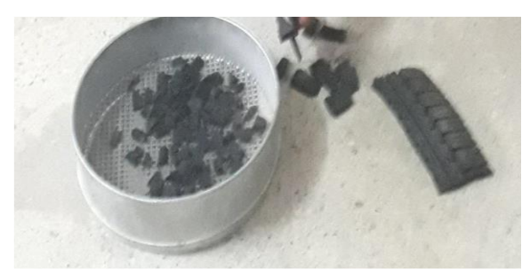
Fig. 1 Chipped tire rubber