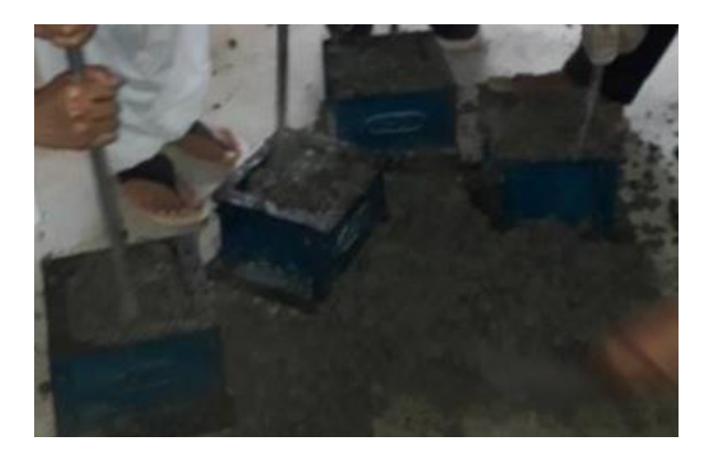
(a) Compaction by using a tamping rod

For sampling first, we should clean the molds (15cm X 15cm X 15cm) and then oil applied in the inner surface of molds. Then fill the concrete mix of 8%, 12%, and 14% of chipped rubber inside the molds (5cm thickness), compact each layer with the help of tamping rod more than 35 strokes. Then the top surface should be smoother using trowel. A sampling of cubes can be identified using Fig. 4.