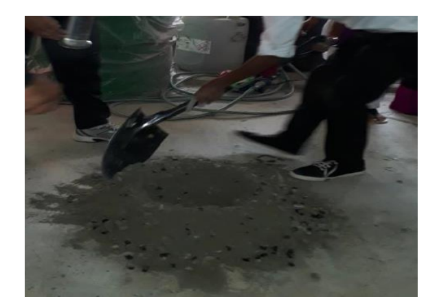
Fig. 3 Mixing of material

The mixing of the materials (fine aggregate, coarse aggregate, cement, and chipped rubber) to form the concrete mix was completed by hand mixing (Fig. 3) with the help of a batch mixer available in the laboratory. The cement and fine aggregate mixed well and blended then coarse aggregate (gravel) added and mix with the material. Then the required amount of water used to form a homogeneous mix of concrete with the desired consistency. The partial replacement of the coarse aggregate with chipped rubber was taken 8%, 12%, and 14%. And then mixed well with the other materials individually.