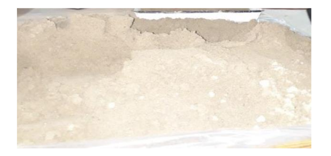
(b) Fine aggregate

Fig. 2 Used Coarse aggregate and fine aggregate in experimental work