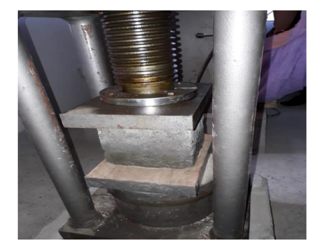
Fig. 7 Compression testing machine