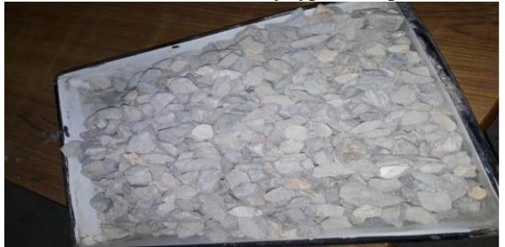
(a) Coarse Aggregate

The aggregates should be hard and strong, free from impurities, and stable. The impurities such as clay, silt, dirt, and organic cells may lie on the surface of aggregates, this may reduce the quality of concrete. The impurities may results that the surrounding particles may isolate which further reduces the strength of mix and this impurity leads to more requirement of water to form the mix. The gravels are used in the study as coarse aggregate and sand used as fine aggregate, shown in Fig. 2 (a & b). And the water used for the mixture, it should be pure and free from chemical or any type of impurities.