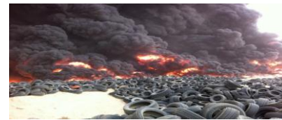
Photo1. Disposal of waste tyres by burning

The way in which the waste tyres are being disposed of by burning has become a health hazard and contributing to Global warming effects by emitting Carbon dioxide (CO 2 ) & Carbon monoxide (CO) (Photo 1).