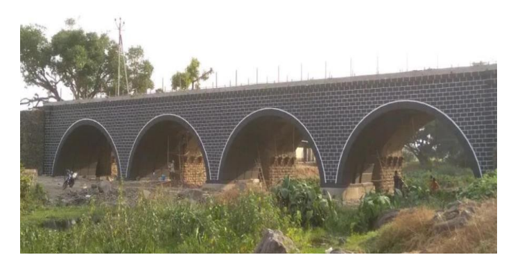
Figure No. 1 Lithely Arch Bridge

Modern Arch Infrastructure, through lithely arch retains the core functionality of Arch bridges, while eliminating all inconveniences. The lithely arch is based on the same principles of the conventional arch bridge and requires absolutely no maintenance once installed. The bridge is designed to have a service life of over 120 years, almost twice that of modern bridge solutions