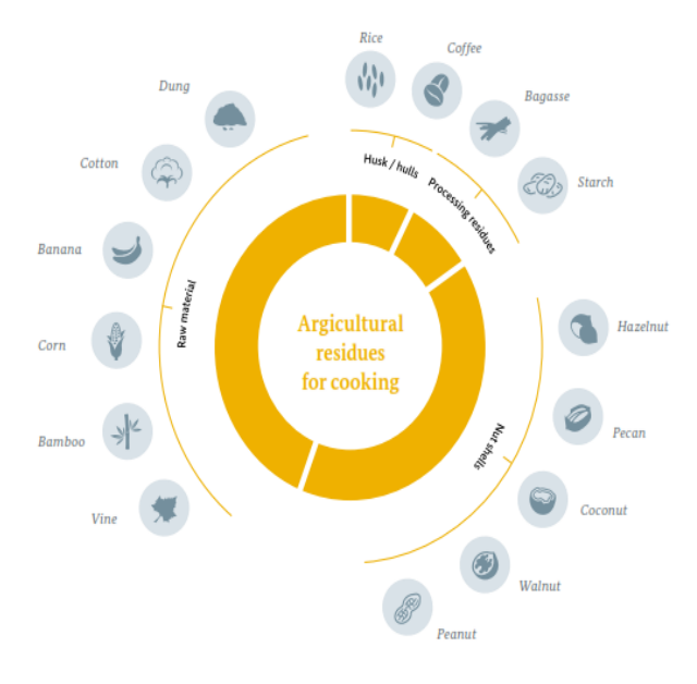
Fig. 4. Categorization of agricultural residues that comprise solid biomass fuels for cooking beyond firewood and charcoal (Helbig and Roth, 2017).

Agricultural residues are generated in large volumes every season, often being discarded as waste. Solid crop residues are the largest source of agriculture based solid biomass, comprising organic residues of straw, stems, stalks, leaves, husks, shells, peels, pits or seeds, pulp and the like from all sorts of crops. The greatest proportion is attributed to stalks of cereals (rice, wheat, maize, sorghum), cotton, and legumes (pigeon pea, bean, soya, groundnut), complemented with woody pruning's from perennial plantations like coffee, tea, cacao and fruits or nuts (mango, banana, cocoa, cashew). Agriculture based biomass is particularly relevant for communities that live close to where the biomass is produced, or for enterprises that seek to increase the performance of their business by creating a value chain based on their agricultural residues (Helbig and Roth, 2017). Fig. 4 shows the Categorization of agricultural residues that comprise solid biomass fuels for cooking.