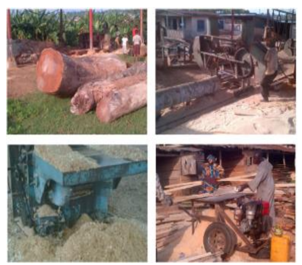
Fig. 2. Activities that generate wood waste in a typical Nigerian sawmill (Babayemi and Dauda, 2010)

About 1.8 million tons of sawdust was estimated to be generated in Nigeria yearly (Sambo, 2009), while about 5.2 million tons of wood residues were reported to be generated (Francescato et al. , 2008). Due to improper disposal methods, these huge quantities of waste are burnt in open fire, dumped in drainages or along the bank of streams and rivers, or left on any available space to rot. Fig. 2 and Fig. 3, show the activities that generate wood waste and local collection and dumping of wood waste respectively in a typical Nigerian sawmill.