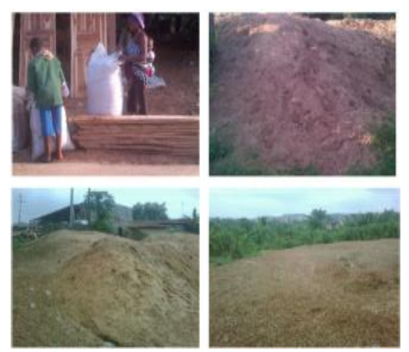
Fig. 3. Local collection and dumping of wood waste in and around a Nigerian sawmill (Babayemi and Dauda, 2010)