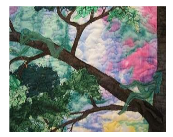
Figure 2: Dryads

He takes the nightingale as a light-winged Dryad of the trees. Dryad is a wood nymph, also called hamadryad, in Greek mythology, a nymph or nature spirit who lives in trees and takes the form of a beautiful young woman. Dryads were originally the spirits of oak trees ( drys : "oak"), but the name was later applied to all tree nymphs. It is believed that they live only as long as the trees live in. For him, the song of the bird is a source of pleasure. The place of solitude is presumed as a place of pleasure and peace. Dryads are represented as peace loving beings.