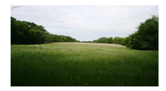
Figure 22: Valley-glades

The poet realizes that imagination and an elf (an imaginary small being with magic power) cannot cheat him for a long time. The song which was regarded as joyous seems to be melancholic. The song of the nightingale starts subsiding and fading away gradually from the meadow, the stream, hill-side and valley-glades. The illusion which his imagination had created now vanishes. The song of the bird also becomes fainter and fainter, and the poet is left in doubt whether he was dreaming all this time or his experience was real. The nature, especially the song of the bird had mesmerizing effect on the poet.