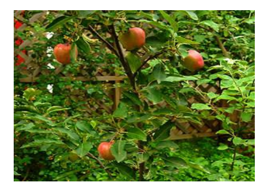
Figure 11: Fruit tree