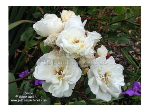
Figure 25: Musk-rose

Although the poet cannot see the flowers due to the thickness of the garden, he recognizes the through their fragrance. He comes to identify that the grass, the thicket, and the