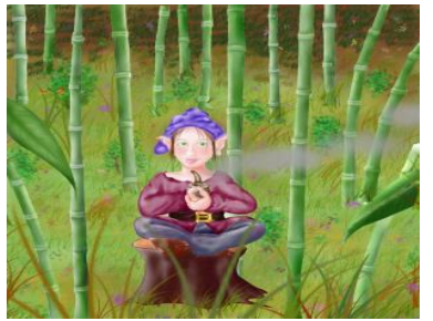
Figure 23: Elf

"Nightingale" is represented as a central entity in the ode. It is such a singing bird which is hardly seen, but her mellifluous song is distinctively perceived. The song of the bird is so affective that the human heart is stirred and moved. The world of the bird is assumed to be a unique world of pleasure, peace and purity. The world of the bird is nature that is always spontaneous, inspiring, pleasing and enigmatic. The bird is also a part and parcel of nature. The ode reveals that the nature / song of the bird influences the human beings, but it does not explore whether nature is influenced by human beings or not. Therefore, natural world is represented as an active force, whereas the poet, the emperor, the clown and a biblical character Ruth are represented as positively beneficialized persons in this ode.