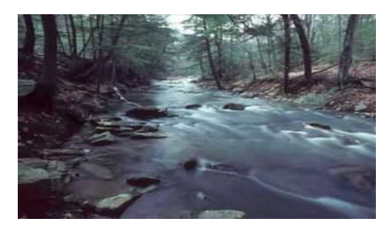
Figure 21: Stream

Fled is that music:—Do I wake or sleep? (76-80)