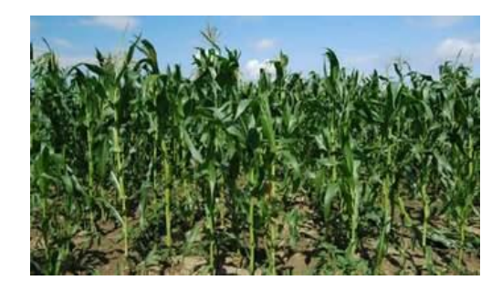
Figure 17: Corn field