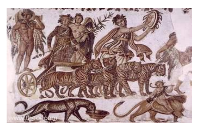
Figure 5: Bacchus, a Roman god of wine

But on the viewless wings of Poesy, (31-33)