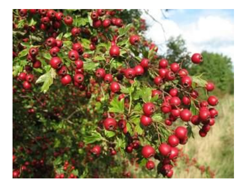
Figure 12: Hawthorn