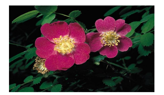
Figure 13: Eglantine