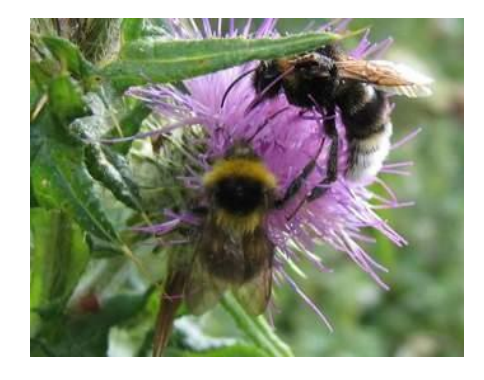
Figure 16: Flies (Bees)

fruit-tree wild, white hawthorn, the pastoral eglantine, violets and the musk-rose are blooming there. Different sorts of flies are flying round these flowers. They are sucking