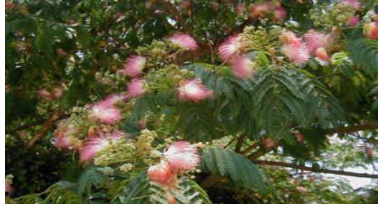
Figure 8: Flowering thick forest

The murmurous haunt of flies on summer eves. (45-50)