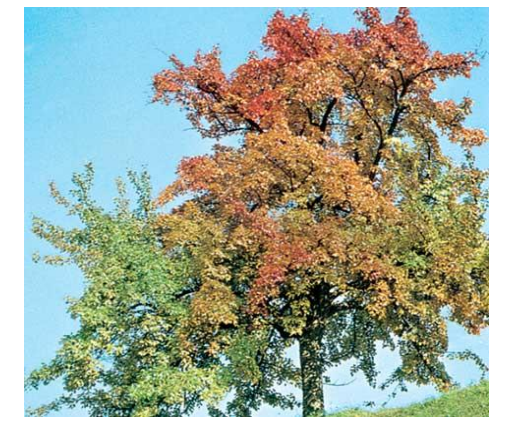
Figure 3: Beech

The poet thinks that he has drunk the water of Hippocrene. Hippocrene is a spring on Mt. Helicon. It is sacred to the Muses and it was formed by the hooves of Pegasus. Its name literally translates as "Horse's Fountain" and the water is supposed to bring forth poetic inspiration when it is drunk. Pegasus is a mythical winged divine stallion who is one of the most recognized creatures in Greek mythology. He desires to disappear into the dark forest as an indispensable component of nature.