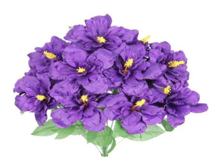
Figure 14: Violet

Although the poet cannot see the flowers due to the thickness of the garden, he recognizes the through their fragrance. He comes to identify that the grass, the thicket, and the