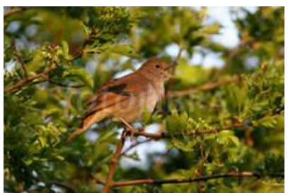
Figure 1: Nightingale

unchanged by man." A nightingale is a major word in the ode. The nightingale is a small passerine bird best known for its powerful and beautiful song. Seeing a nightingale is always difficult, as it is famous for its ability to lurk in thick cover where it is difficult to mark.