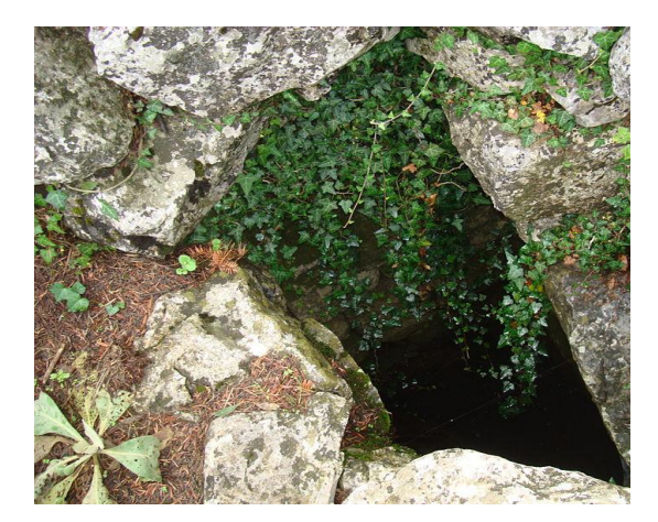
Figure 4: Hippocrene source on Mt. Helicon

And with thee fade away into the forest dim. (16-20)