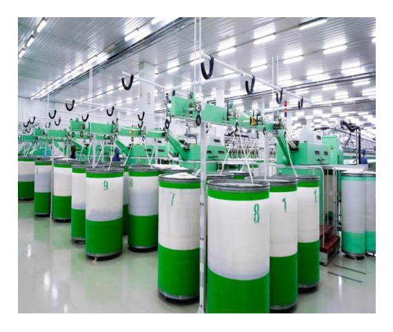
Fig. 2. Spinning Machine

Automation has been achieved in spinning by the invention of machines like ring spinning, air-jet spinning, rotor spinning, Vortex spinning etc. Improvements in Ring spinning machines have taken place through drive systems, drafting systems and use of robotics. Yarn fault detection has been automated now to improve the production and to get the uniform yarn quality. Yarn knots have now been replaced with the joints using splicing techniques like air splicing, wet splicing, hot air splicing and moist air splicing which minimizes the defects in final fabric thus produced. Transport automation is done using robots to carry out heavy takes which were earlier done by humans. Package collection from the spinning mills and even palletizing and packaging is being done these days using automated solutions. All these automation in the spinning process has reduced the need of the skilled manpower.