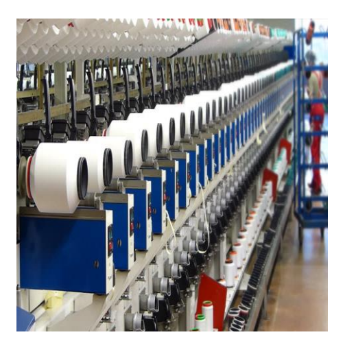
Fig. 3. Weaving Factory

filling colours, break detection data collection etc. which has helped in improving the production as a lesser labour cost.