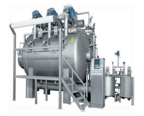
Fig. 4. HT Synchron Airjet Fabric Dyeing Machine