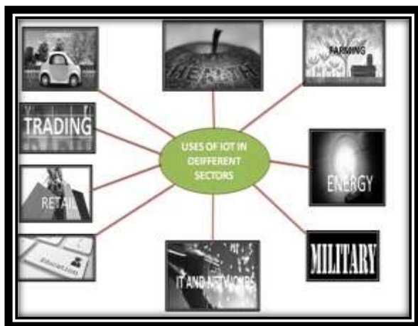
Fig. 3: Uses of IOT