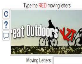
[Figure 2 Video Captcha]