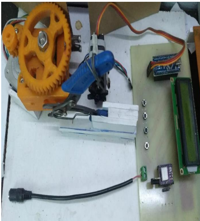
Figure 3: Experimental setup of proposed system

The discussed system is implemented on small size Basics implemented system is as shown in figure 3 below.