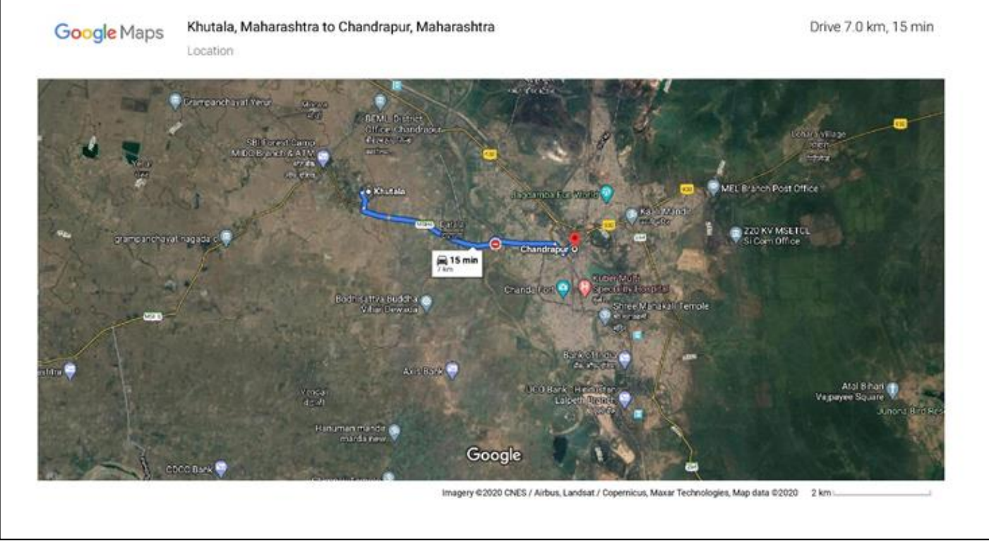
Fig. 1. Location and distance between two stations.

The opposite of CO, SO<sub>2</sub> in the city centre seems very