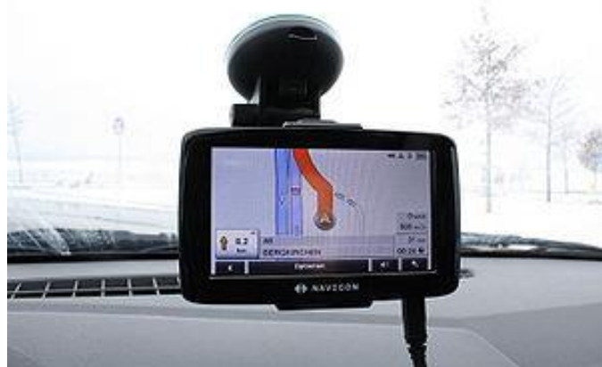
Fig. 4. Navion GPS Navigation Device on a Car Dashboard

The extensive bandwidth augmentation system (WAAS), available since August 2000, increases the accuracy of GPS within 2 meters for compatible receivers. With GPS, precision can be improved to 1 centimeter, using other techniques such as GPS differential equation (DGPS).