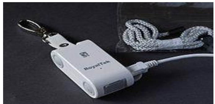
Fig. 8. Typical GPS Recorder

Satellite navigation receivers reduce errors by using combinations of signals from multiple satellites and then using techniques such as Kalman filtering to reduce noise.