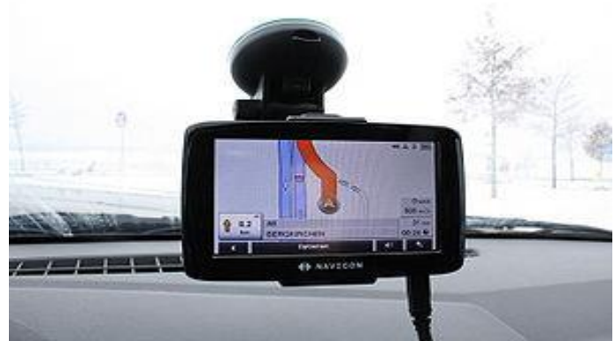
Fig. 9. Navion Navigation GPS Navion, Above the Dashboard - the Most Common Aftermarket Installation

All such devices are accompanied by a stand that is placed in the vehicle at a point visible to the driver but does not prevent it from driving. This means that you must have taken into account the space provided and the size of the device.