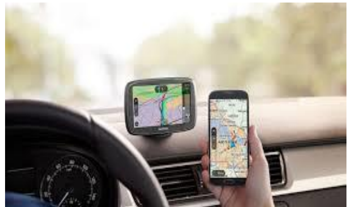
Fig. 1. GPS Mode Using Smartphone in Car

Today, alarms have seen a rapid development. Wired, wireless and hybrid panels are available in the global marketplace to meet any requirements and needs, all of which are always remotely and naturally through our smartphone device.