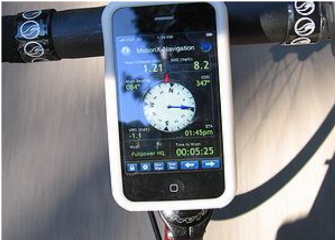
Fig. 6. GPS Satellite Navigation, on a Smartphone, on a Bicycle