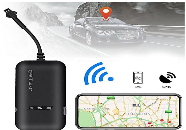
Fig. 7. GPS Tracking Unit

elsewhere, such as a boat, a second car, home (if it is a computer).