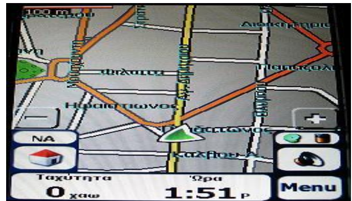
Fig. 5. GPS Navigation Device Displays

The precision through correction reaches 3 - 5 meters.