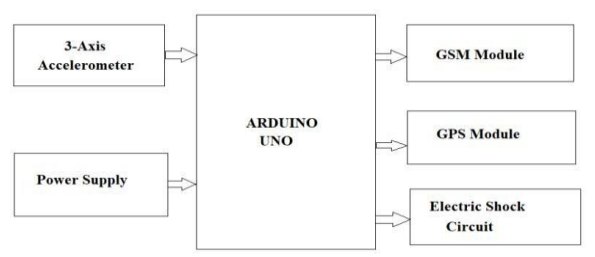
Fig.1 Block Diagram

The block diagram of our proposed system is as shown in Fig..1: