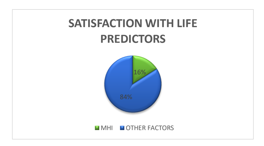
Figure 2: Pie chart highlighting % of variance contributed by MHI as predictor towards SWL

variance. This trend indicates that if mental health have been promoted among the defense personnel their satisfaction with life would ultimately enhance. The same has been highlighted with the help of pie-chart.