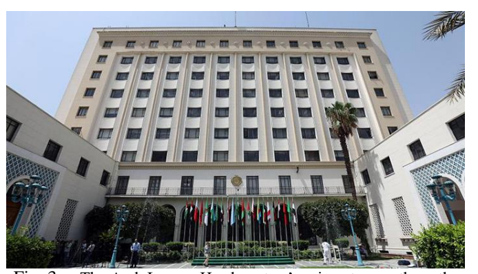
Fig. 3. The Arab League Headquarters' main entrance

The City Centre and the historic Cairo were considered antiquities from a decaying past, thus were treated as touristic site seeing. Since Cairo Down Town was seen as a colonial symbol, it was neglected by the Nasser regime. Few urban interventions took place during the Nasser era, but some old regime's projects were completed. One of Nasser's urban