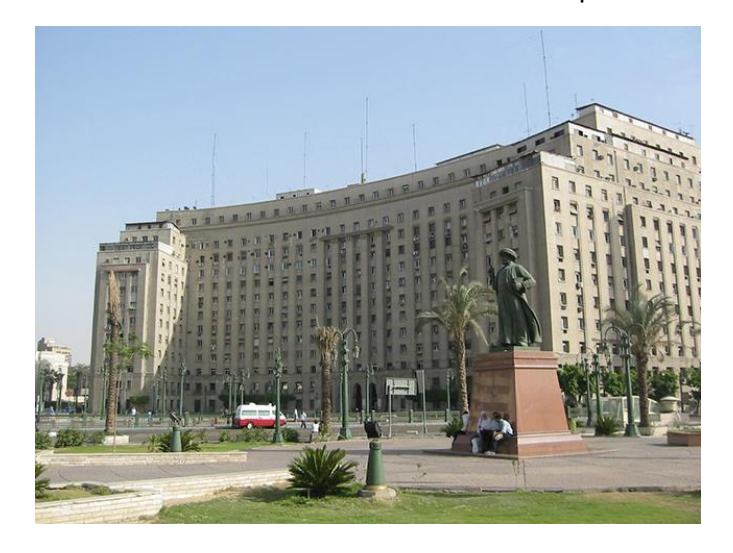
Fig. 5. The Mogamma, the author

Perhaps the genuine triumph of colonialism was not achieved in battles but the fields of culture and education. Culture and education created new embedded historical roots in the way of thinking of both the Egyptians intellectuals and the ordinary Egyptians (S. Saad 2019). During the 19<sup>th</sup> and 20<sup>th</sup> centuries, European powers were not only invading the east, 'but "European buildings" styles were cropping up in its cities and shaping their appearance' (Rabbat 2010).