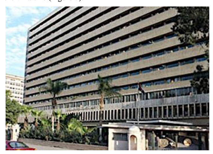
Fig. 7. The Accountability Central Authority building in Medinet Naser

Nevertheless, Nasser's regime's fear of diminishing its political control over the labor force prevented satellite towns' implementation (Serageldin 1985, 123) and shifted to suburban development. Since the villa was the primary residential type in Medinet Nasr , a bright contrast was created. The contrast was achieved due to the authoritarian building's grandeur that stood for the state's power and modernity against the villa size (Figure 7).