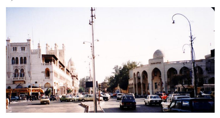
Fig. 6. Heliopolis, the author

Parallel to the intellectual debate about the Egyptian identity, Heliopolis designed and planned in 1910. It was the achievement of a Belgium urban development company owned by the Baron 'Edward Empain'. Its architecture adopted a style that might be considered similar to the 'neo-Mamluk' but in a different visual mixture. Heliopolis's architecture presented a mixture of motives and elements from distinct parts of the Muslim World, from Andalusia to India (Figure 6).