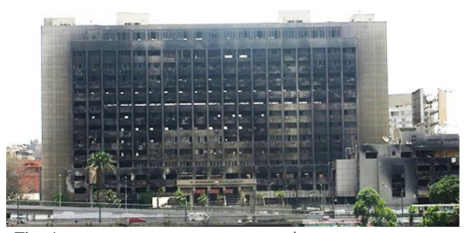
Fig. 4. The Socialist Union after the 25<sup>th</sup> of January revolution

The Socialist Union headquarters was constructed in 1958, located northern of Midan el-Tahrir , and overlooking the Nile (Figure 4). It was built over the demolished British Barak and a palace from the Egyptian monarchy to represent the new socialist state's modernity. The emphasis on building's grandeur was intentional because the building represented the socialist state's authoritarian power. Its location overlooking the vast area of Tahrir , the Nile, and the Museum for Egyptian Antiquities increased its visual impact (S. Saad 2018).